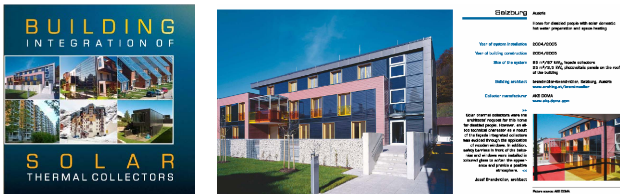
Figure 1: Cover and one of the presented objects

The presented objects are described with one large picture of the building and the integrated solar panels and with smaller pictures, presenting details, other views of the building or solar panels. Further, a table gives the key figures for the project, including the year of solar thermal system installation, the year of building construction, size of the solar thermal system, building architects and the collector manufacturer. Each object is also commented by the architect.